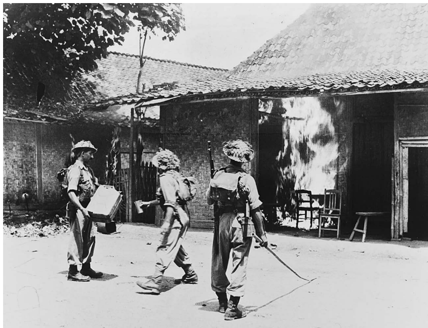
FIGURE 1.1 During the partial Allied occupation of Java and Sumatra, British-Indian troops burn down houses in Bekasi on 13 December 1945. Large parts of the town were destroyed as a collective punishment for the brutal murder of five members of the Royal Air Force and twenty British-Indian riflemen whose Dakota aircraft crash-landed near the town.

rather than the stubborn but weakening Dutch allies formed the best antidote against communism in Southeast Asia. 7 Ignoring the writing on the wall, the Netherlands nevertheless launched yet another major offensive in December 1948—the second “police action”—this time aimed at “decapitating” the Republic by conquering its capital and arresting its political and military leaders. This led to ever more intense guerrilla warfare, a similar faltering counterinsurgency campaign by the overstretched Dutch army, atrocities on all sides, and unprecedented international condemnation of the war-weary Dutch. All these factors together led to a speedy negotiated withdrawal in late 1949 and the formal transfer of sovereignty on 27 December 1949.